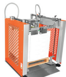
Pallet Stacker and Delivery System

* List above is not exhaustive. Skandacor™ to advise which options are available for which systems.