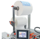
Double Film Changer